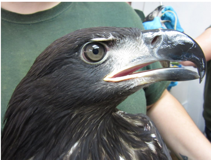
An eagle that fell from a tree on Cloverleaf Lakes is now fully grown and ready to be returned to the wild. The eagle was scheduled to be released on Jan. 17 in Sauk City.

Now fully grown and accustomed to living with other eagles, the eagle was to be released along the Wisconsin River.