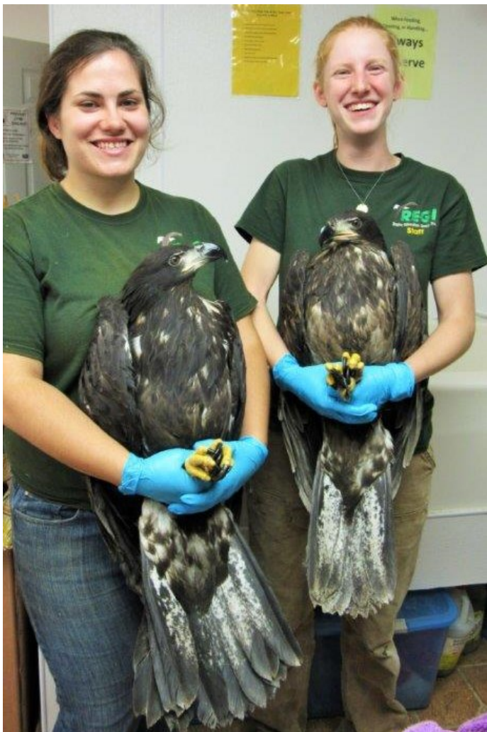
Volunteers at the Raptor Education Group Inc. in Antigo hold two “baby” eagles, including one that fell from a tree on Cloverleaf Lakes in June.